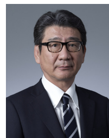
President Naohiko Kishi

Through Koshiraeru , we hone our specializations and implementing strengths and strengthen our customer activation powers. We are a professional collective of over 1,800 people who love Koshiraeru . At Hakuhodo Product's, we continue to work to be an integrated production company with ever stronger power to activate customers.